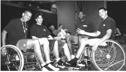
NCC Lions Get Ready to Play the Nassau County Kings Wheelchair Basketball Team at Nassau Community College

The Nassau Community College Access Club hosted its first annual Wheelchair Basketball Game in the NCC Physical Education Complex. The NCC Basketball team, NCC Lions , played the Nassau County Kings Wheelchair Basketball Team in this special benefit game. The purpose of this event was to promote the growth and development of disabled athletes.