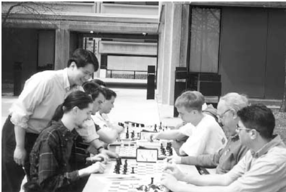
NCC Chess Club practices sharpening their skills and strategies.

NCC Chess Club Beats Hofstra in Local Tournament For Second Consecutive Year