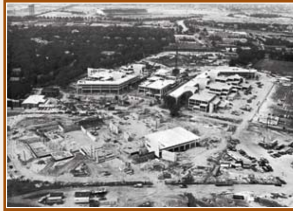
Campus construction, circa 1975.

In many ways, the history of Nassau Community College mirrors the history of Long Island. After World War II, prosperity and population growth fueled a mass migration to the suburbs. The post-war baby boom caused a swell of school construction across the country. By the 1950s, a generation of parents—many of whom had gotten a college education via the GI Bill—wanted their kids to go to college as well. The drive was on to create an affordable college on Long Island.