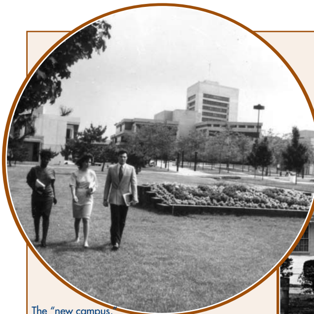
The "new campus," circa 1980.