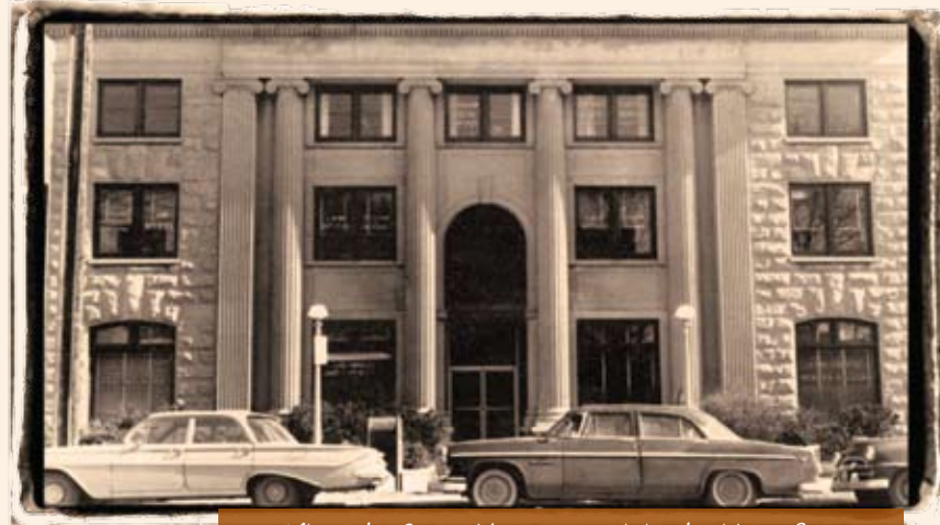
Mineola Courthouse, original site of Nassau Community College, circa 1960.

Nassau Community College Celebrates 50 years of success with a gala 50th anniversary reception