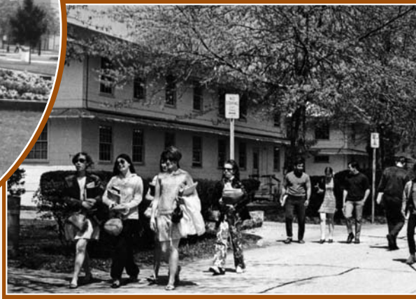
Former Mitchel Field military barracks were used as temporary classrooms during the early days of NCC.