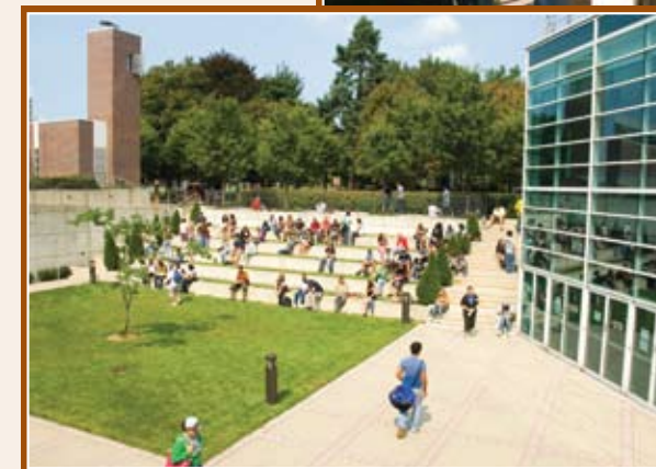
The courtyard adjacent to the College Center Building.

athletic, cultural, religious, political and social clubs are available to students. Nearly 70 percent of NCC graduates go on to a four-year school.