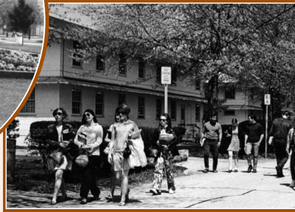
Former Mitchel Field military barracks were used as temporary classrooms during the early days of NCC.