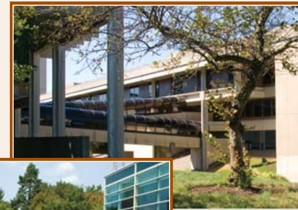
The Cluster buildings were completed in the late '70s.

Today, Nassau is the largest single-campus community college in the state of New York. More than 22,000 students are enrolled in 30 academic departments. Among them are individuals from nearly 60 countries who speak 35 different languages. Another 14,000 people take non-credit continuing and professional studies courses. Over 110 academic,