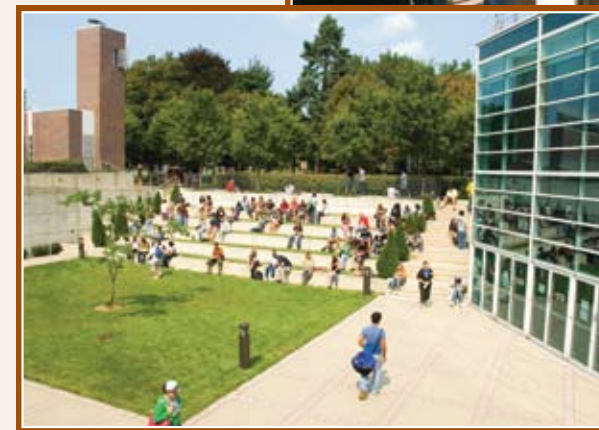
The courtyard adjacent to the College Center Building.

athletic, cultural, religious, political and social clubs are available to students. Nearly 70 percent of NCC graduates go on to a four-year school.