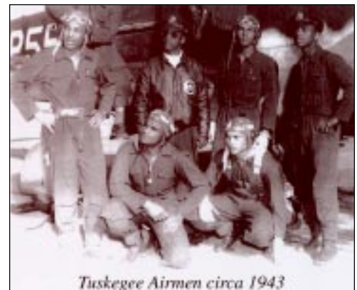
Tuskegee Airmen circa 1943

The students, faculty and members of the community who attended the discussion by the Tuskegee airmen were motivated by their stories and inspired by their commitment to their country in the face of discrimination. The airmen also stressed the importance of education in the continuing effort to overcome racial and economic barriers.