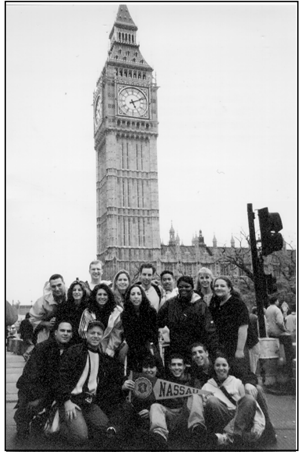
NCC Hotel and Restaurant Management students pose for a group photo in front of London's Big Ben.

NCC students interested in the hospitality business had the opportunity to enrich their knowledge by working in a foreign hotel or restaurant last summer on the International Work Abroad Program in London. Preparations are already underway for next summer's program, which offers students not only hands-on work experience, but also the invaluable benefits of living and learning in another country. For more information about this program call the NCC Hotel and Restaurant Management Department, 572-7344.