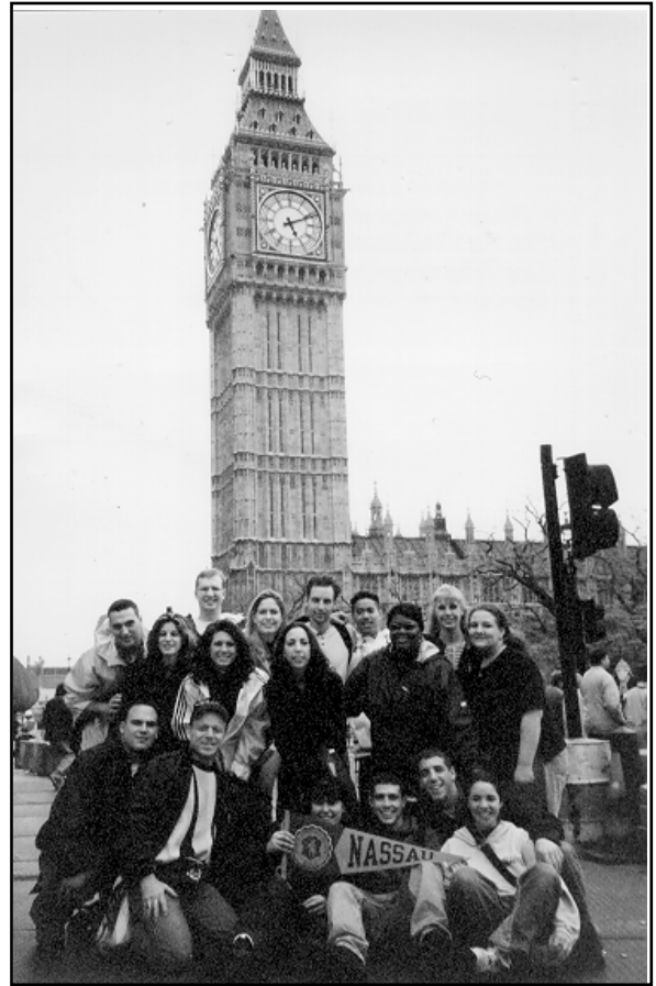
NCC Hotel and Restaurant Management students pose for a group photo in front of London's Big Ben.

NCC students interested in the hospitality business had the opportunity to enrich their knowledge by working in a foreign hotel or restaurant last summer on the International Work Abroad Program in London. Preparations are already underway for next summer's program, which offers students not only hands-on work experience, but also the invaluable benefits of living and learning in another country. For more information about this program call the NCC Hotel and Restaurant Management Department, 572-7344.