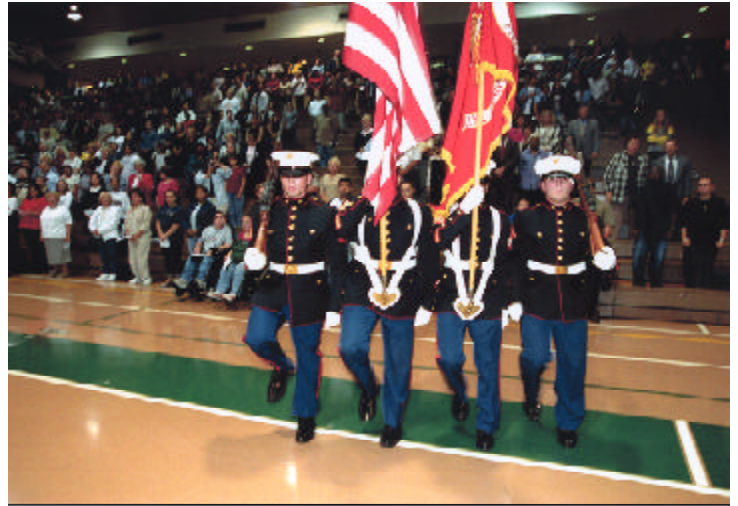
The U.S. Marine Color Guard presents the colors to open the remembrance