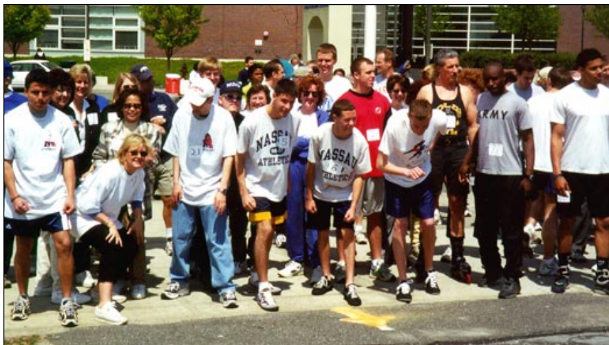
The 2000 Nassau Community College 5K Fun Run/Walk

Among the many philanthropic activities the Nassau Community College community participates in are the NCC 5K Fun Run/Walk and American Heart Walk.