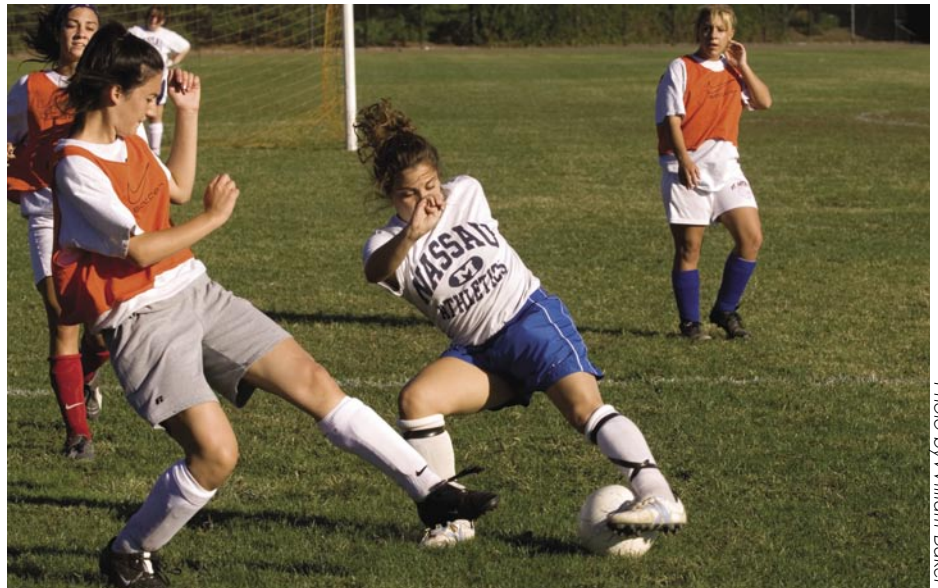
Members of the NCC Women's Soccer team practice at Mitchel Field.

NCC has sports for every season. Fall sports include women's and men's soccer, women's volleyball, men's and women's cross country track, women's tennis, men's and women's bowling, men's football and men's ice hockey. Ice hockey games take place at Iceworks Arena in Syosset. Outdoor sports are played at Mitchel Field Athletic Complex, Eisenhower Park and sometimes on the campus' quad field. The NCC bowling team bowls at Garden City Bowl, while other indoor sports take place at the George B. Costigan Physical Education Complex on campus. In winter, all sports, such as men's and women's basketball and wrestling, move indoors. There are many sports in the spring as well: softball, men's